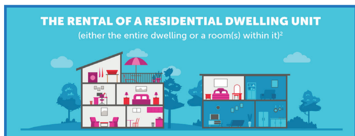
THE RENTAL OF A RESIDENTIAL DWELLING UNIT (either the entire dwelling or a room(s) within it) 2

Short term rental refers to the accommodation of paying guests in an entire single family dwelling, room(s) within a single family dwelling, secondary suite, apartment or condo for less than 30 days.