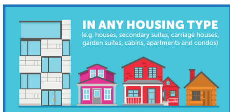
IN ANY HOUSING TYPE (e.g. houses, secondary suites, carriage houses, garden suites, cabins, apartments and condos)