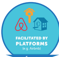
FACILITATED BY PLATFORMS (e.g. Airbnb)