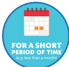
FOR A SHORT PERIOD OF TIME (e.g. less than a month)