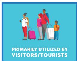
PRIMARILY UTILIZED BY VISITORS/TOURISTS