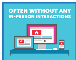
OFTEN WITHOUT ANY IN-PERSON INTERACTIONS